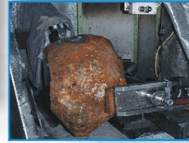
..Cutting the rough material in 4 steps