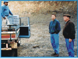
Choosing the rough material in the mines