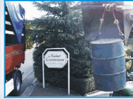
..Transporting the rough stones