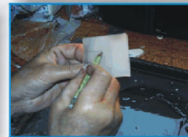
..Presorting the slabs