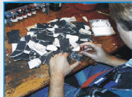
..Sorting the refined slabs