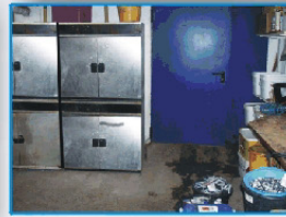
..Refining the slabs