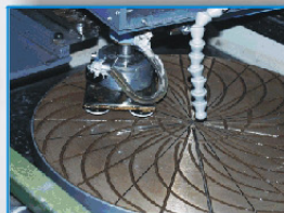
..Cutting the Cameo Stone